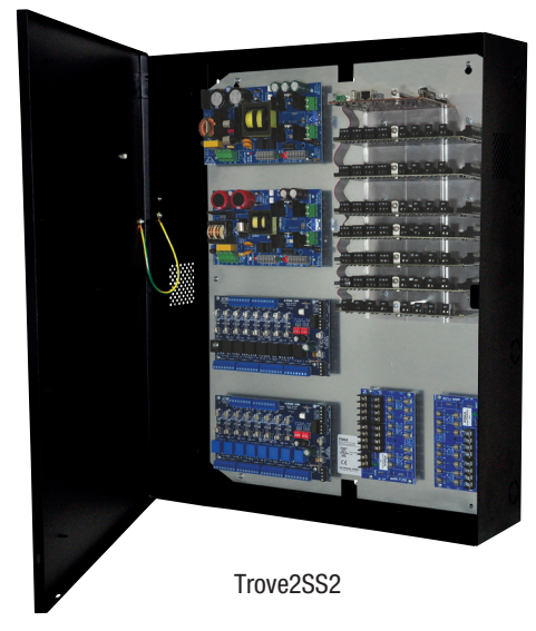
* Boards not included